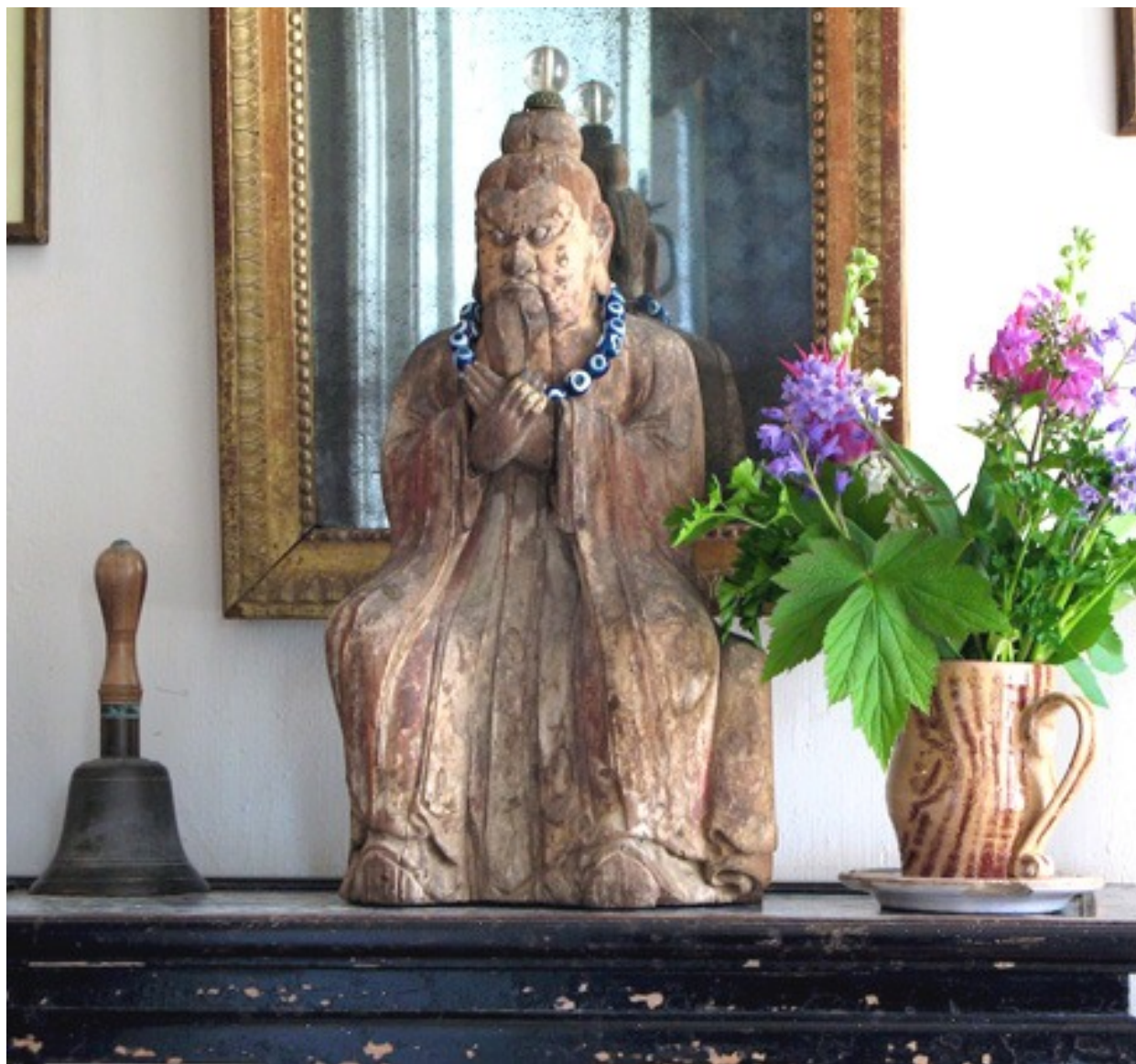
Charleston, East Sussex

Report and photographs from our 2013 AGM and Faith Day