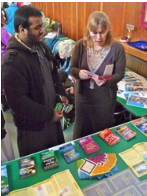
Muslim, Jain, Jewish and Pagan participants exchanging information. The Call to Evening Prayer was a moving experience to all.